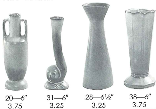
20—6" 3.75 31—6" 3.25 28—6½" 3.25 38—6" 3.75

Small containers perfect for miniature or dried arrangements.