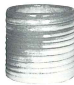
272—4" RINGED CYLINDER VASE 3.25