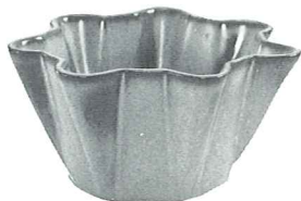
F33—3¾x7" FLUTED PLANTER 5.50