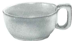
4SC—5" CUP-BOWL 3.75