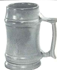
M2—6"—18 OZ. MUG 4.50