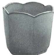
37—4" HEXAGONAL PLANTER 3.25