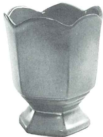
65—6½" HEXAGONAL VASE 6.50