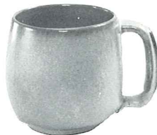
4M—4½"—18 OZ. MUG 4.50