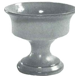
F52—7" PEDESTALLED URN 6.50