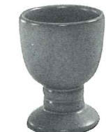
26LC—4½"—6 OZ. TUMBLER VASE 3.25