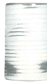
172—6½" RINGED CYLINDER VASE 4.75