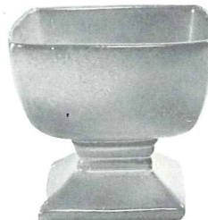
23A—6" SQ. PEDESTALLED VASE 6.50